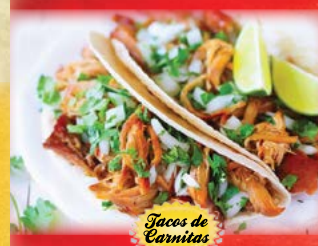
Tacos de Carnitas

ADD GRILLED SHRIMP TO ANY OF YOUR FAVORITE DISH FOR 5.25