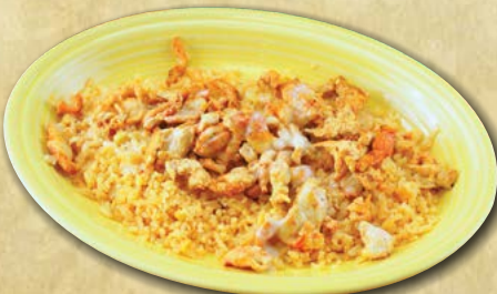
Arroz con Pollo

ADD GRILLED SHRIMP TO ANY OF YOUR FAVORITE DISH FOR 5.25