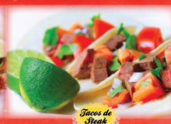
Tacos de Steak