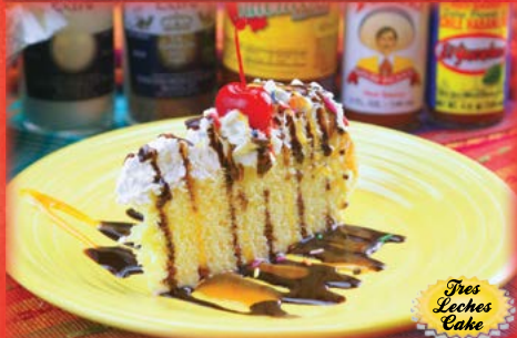
Tres Leches Cake