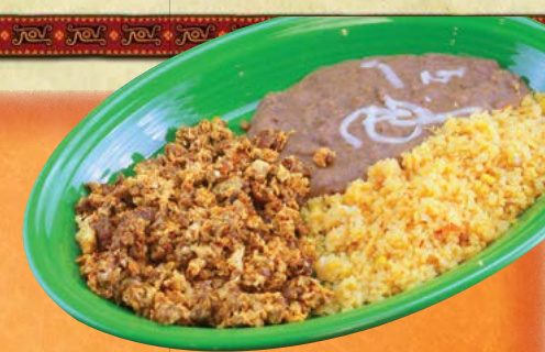
Huevos con Chorizo