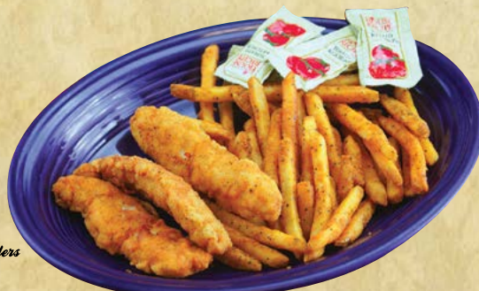
Chicken Tenders & Fries