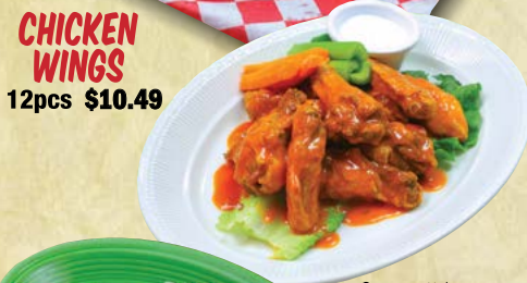
CHICKEN WINGS 12pcs $10.49