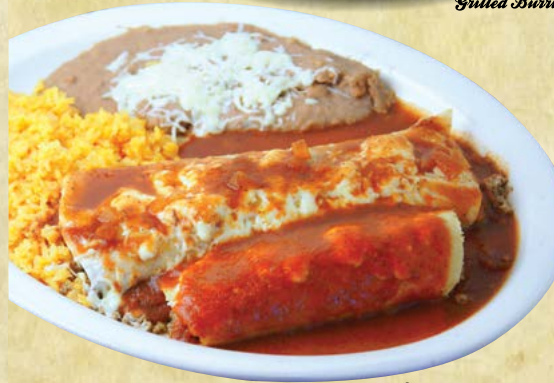
Combo Two Items

ADD GRILLED CHICKEN OR STEAK TO ANY OF YOUR FAVORITE DISH FOR 4.50