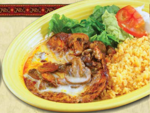
Pollo Santa Fe