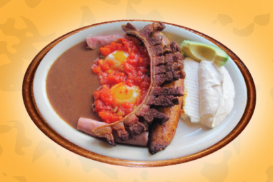
BREAKFAST 10.99 MONTECRISTO (DESAYUNO MONTECRISTO*) Sunny Side Eggs, Ham, Bacon Strip.